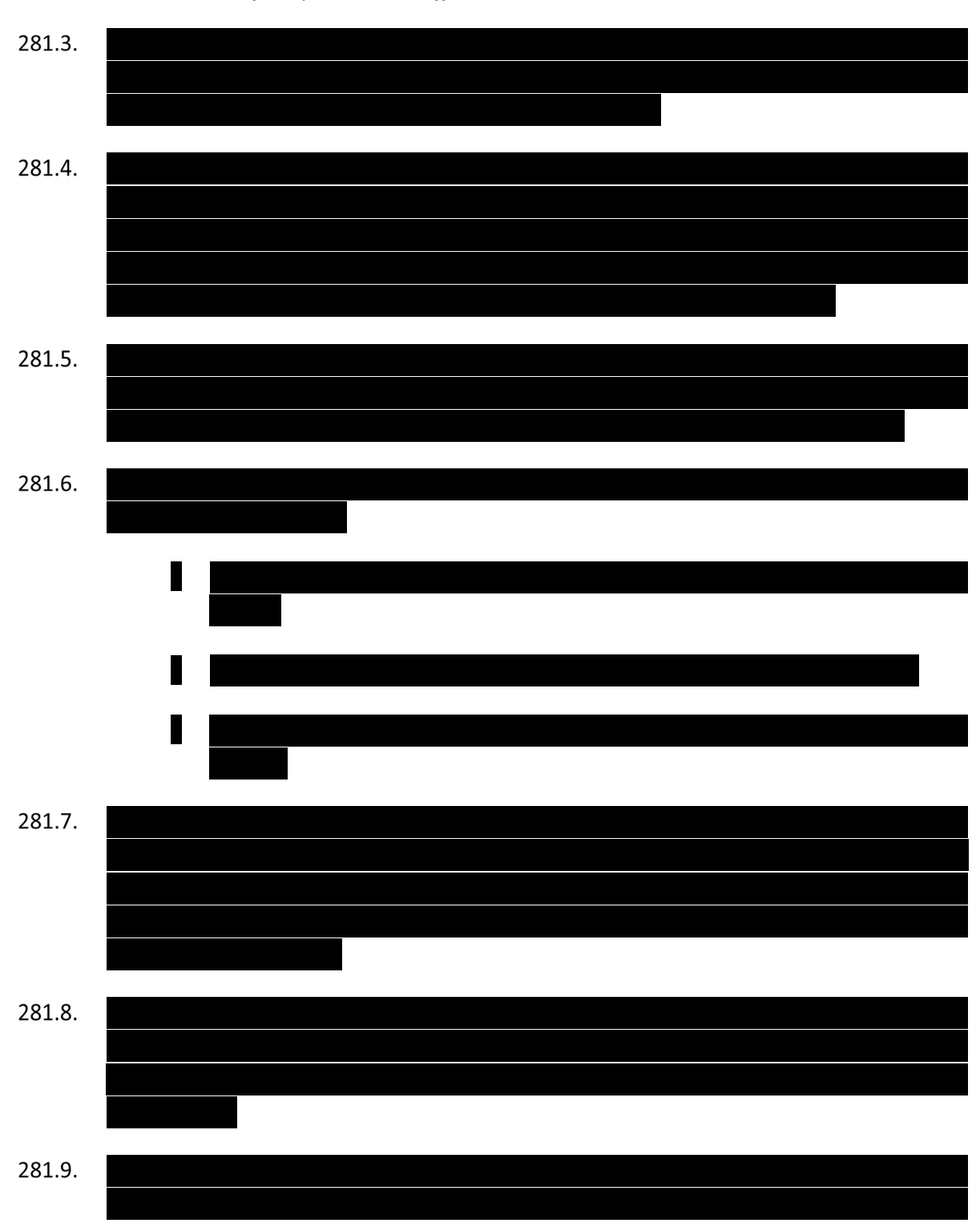
Page | 13

New Contracts for Operational Staff (CONFIDENTIAL) (PUBLISHED ITEM TO BE REDACTED)